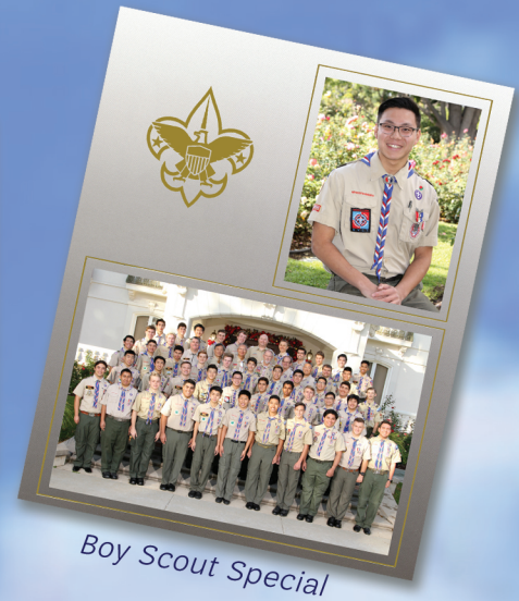
Boy Scout Special