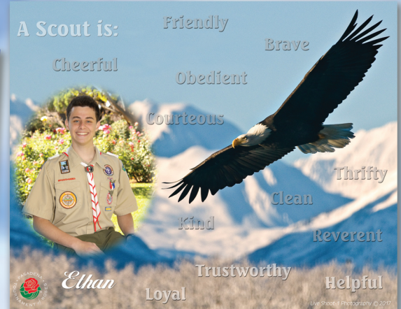
Boy Scout Law