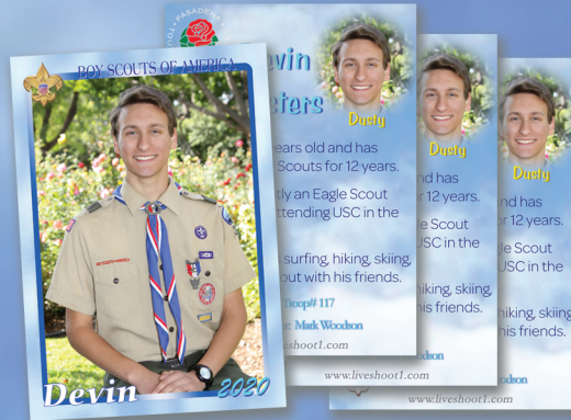
Boy Scout Trading Cards