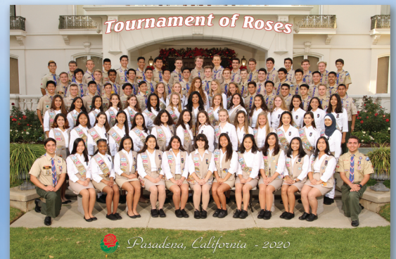
All Troop Print