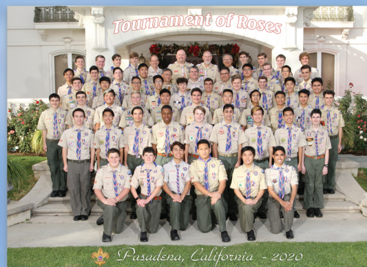
Boy Scout Troop